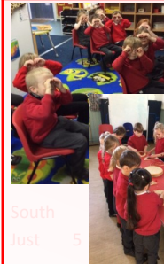
South Just 5

This term Oak Class have jetted off on a journey around the world! We have made pizza in Italy, been skiing in the Alps, sketched the Eiffel Tower, chalked the Northern Lights and danced the flamenco in Spain. In Africa, we jumped in a safari jeep across the savannah, tasted fruit from Handa's Surprise, played African drums and learnt the South African children's dance Jan Pierewiet. Just 5 more continents to visit!